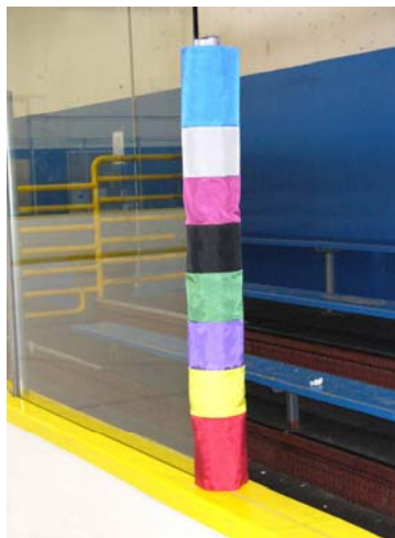
Glass Bumper Pads In Many Colors